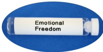
Standard EF vial – http://www.efvial.ehdef.com

This EF vial is an energetically charged vial of water. This EF vial has instructions to energetically run EFT (Emotional Freedom Techniques). What is energetic EFT? Energetic EFT means you are doing numerous topics, even thousands of topics, at the same time at a subconscious level instead of doing just one topic at a conscious level with mental EFT.