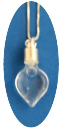
Pendant EF vial – http://www.pv.ehdef.com

As physical EFT tapping is a bridge to appreciating mental EFT tapping, so mental EFT tapping is a bridge to appreciating supercharged energetic EFT tapping with this EF vial.